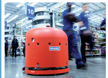
Shopping Mall with obstacles 60 min/800 – 1000 m 2