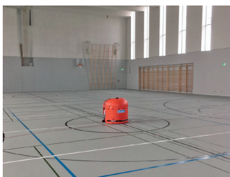
Sports halls without obstacles 60 min/1400 m 2

RA660 Navi is suitable for thorough and consistent cleaning of supermarkets, shopping malls, open space offices, showrooms, large corridors, factory buildings, warehouses, halls and large airport spaces.