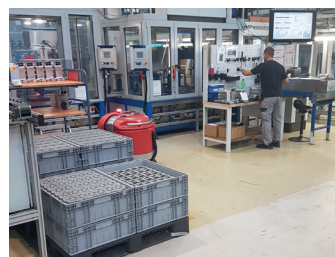
Environments with obstacles 60 min/700 – 800m 2