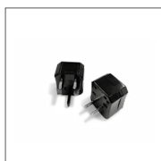
Universal plug adapter (EU - UK - US/JP - CN/AU)