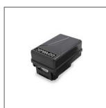
Lithium battery (18V / 4Ah) to increase working autonomy