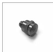
Nozzle size 0,3 mm