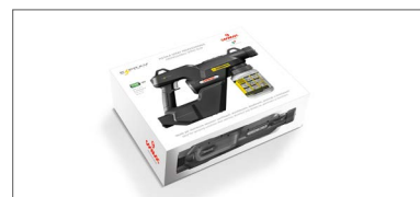
Printed cardboard packaging