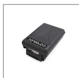
Lithium battery (18V / 2Ah)