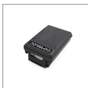
Lithium battery (18V / 2Ah)