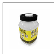
Tank with cap (1 l) and maintenance instruction label