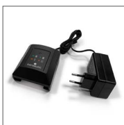
Battery charger (18V / 0,4A)