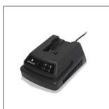
Battery charger (18V / 2A)