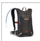
Long Range backpack with additional 2-litre tank