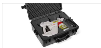
Shockproof kit box