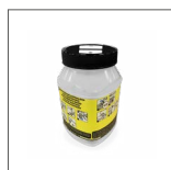
Tank with cap (1 l) and maintenance instruction label