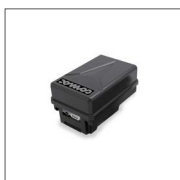
Lithium battery (18V / 4Ah) to increase working autonomy