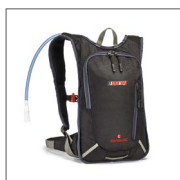
Long Range backpack with additional 2-litre tank